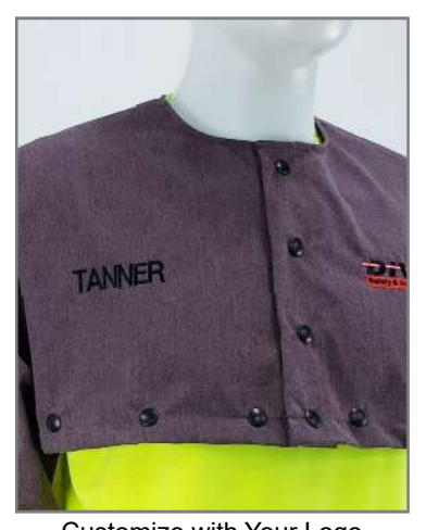
Customize with Your Logo and/or Team Member's Name